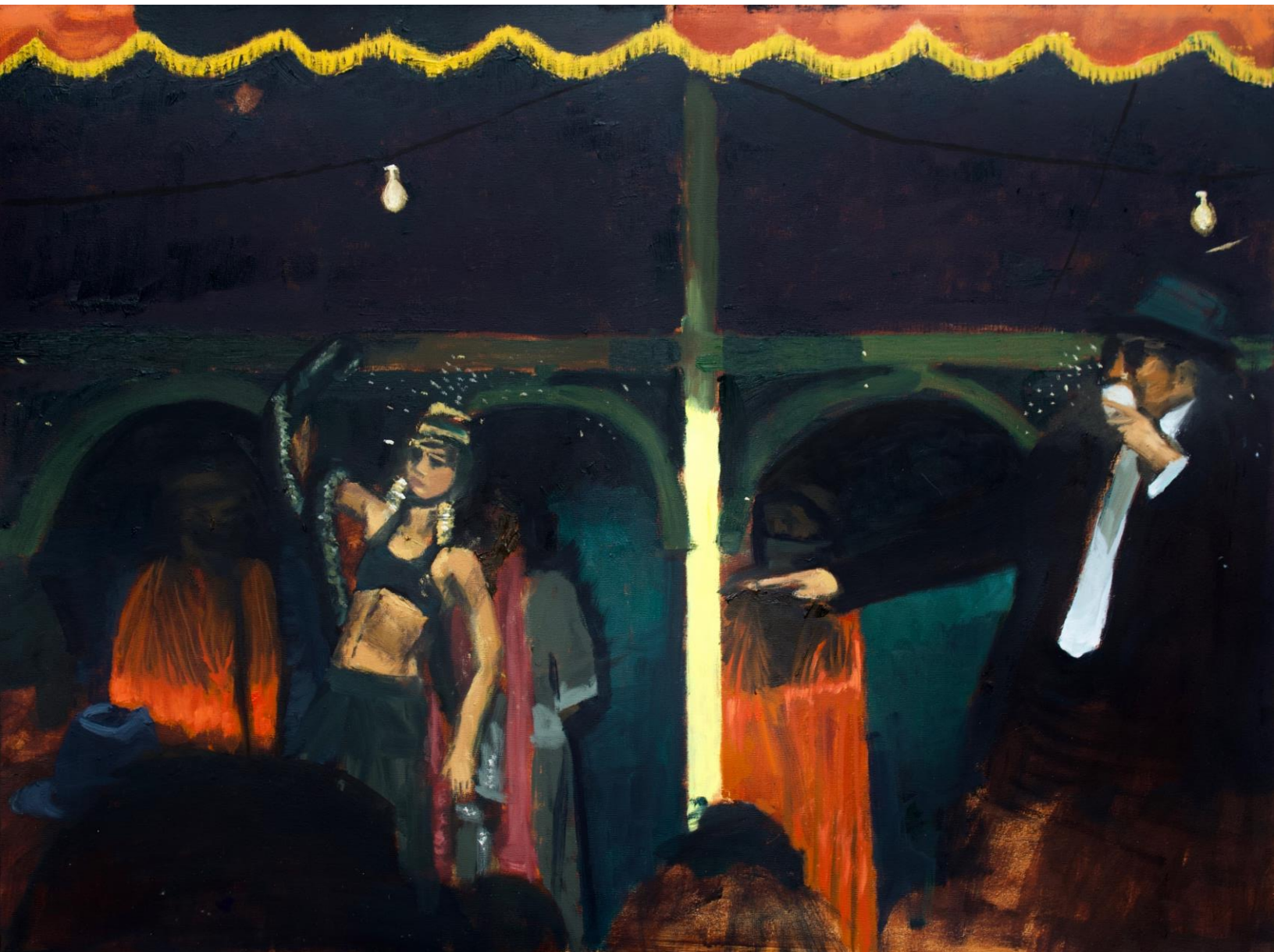
Charmer / 18" X 24" / wood panel