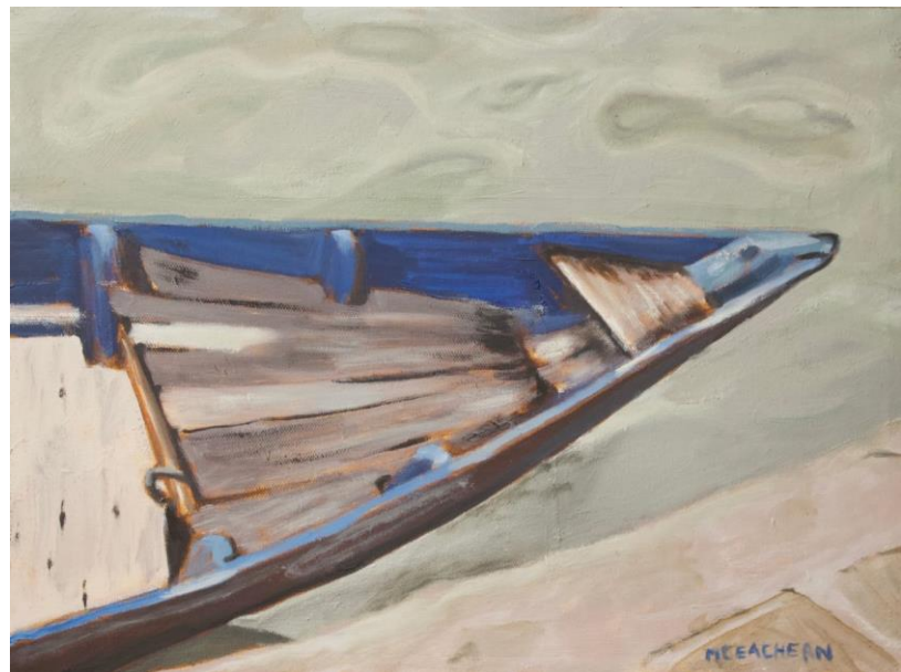
Ripples / 12" x 16" / oil on canvas