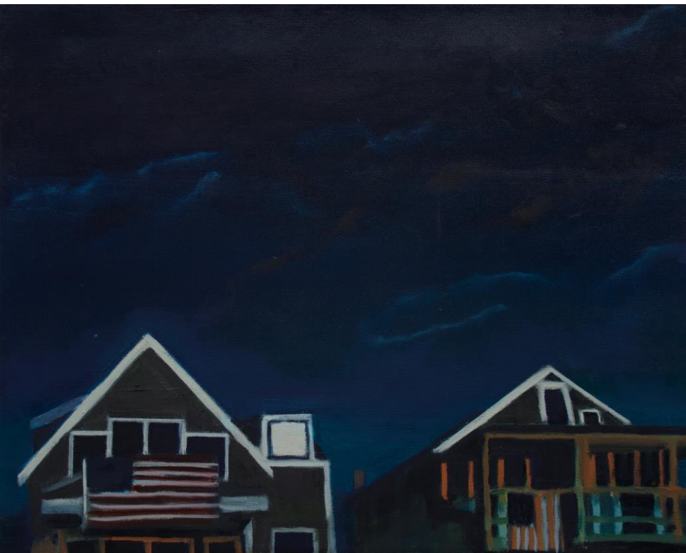
bottom right: Drip / 6" X 8" / acrylic on canvas