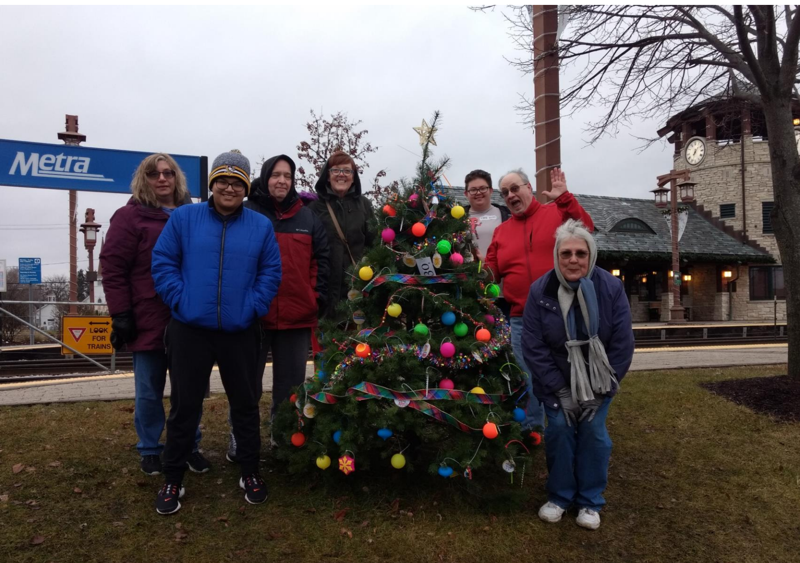
PFLAG Tinley Park members after decorating the tree

PFLAG Tinley Park has been busy in the community. At our November meeting, we had a great discussion with a local middle school principal who wanted input on what more he could be doing for LGBTQ students. He is an incredible ally! We also took part in the Transgender Day of Remembrance in Frankfort with Southwest Suburban Activists, and the head of their Pride Committee will be a speaker at our December meeting. Finally, a hardy group braved the chill and wind before the blizzard arrived to decorate a tree at the Oak Park Avenue Tinley Park Metra station for the Tinley Park Chamber of Commerce's Trim-A-Tree event. The PFLAG tree is decked out with PFLAG ornaments we made mixed with brightly colored shatterproof round ornaments. It's bright, fun, and shares our message of PFLAG love and support. We had so much fun making it!