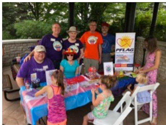
PFLAG DuPage at Morton Arboretum's Second Annual Family Pride Night.

Since the last edition of Open Doors went to press, we represented PFLAG at the Second Annual Family Pride Night at the Morton Arboretum on June 28 th . We had a safety pin decorating craft for the children, lots of buttons (the children were fascinated to see how they are made), and rainbow flags. It was quite a sight to see dozens of children waving those flags!